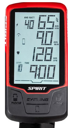
Wireless LCD Console with Bluetooth FTMS

The CIC850 is a high performance indoor cycle that is extremely versatile. Magnetic resistance (1-100 levels), commercial grade Hutchinson poly-v belt, 4-way seat and handlebar adjustability, and heavy-duty three-piece crank provide a low-maintenance solution to your high-performance needs. The wireless smart resistance knob makes resistance changes a breeze and pairs with the console to keep you informed. The combination of a large LCD Bluetooth console and adjustable tablet holder allows users to use their phone or tablet to help train with 3 rd party apps. Small dumbbells can be stored right under your seat for easy access during workouts and the dual water bottle holders keep hydration within reach.