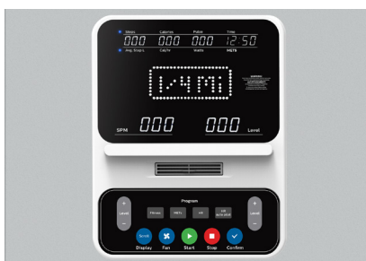
Intuitive, easy-to-read display

Whether at home or in a clinical setting, the compact design and smooth operation ensure convenience without compromise.