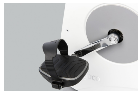
Each pedal is slightly inverted for an optimal foot angle