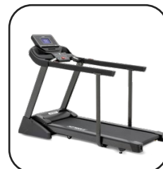
Optional Extended Handrails