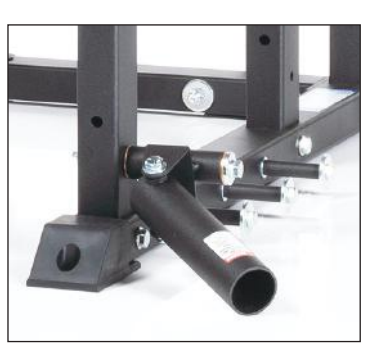
CG-8825 Landmine Attachment & CG-8824 Band Pegs