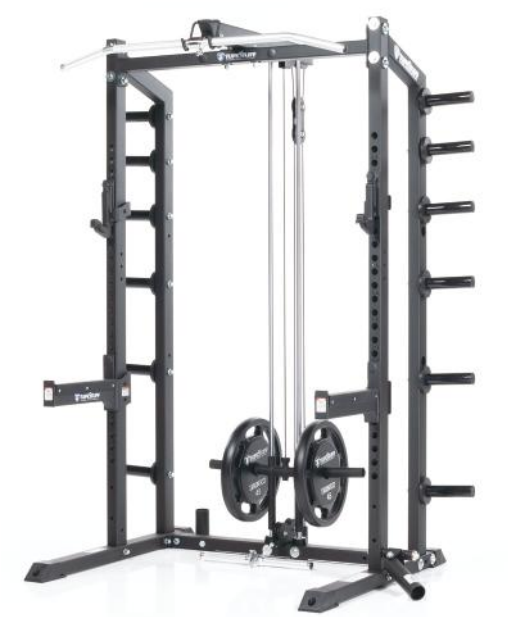
CG-8826 Hi/Low Pulley Attachment Plate Load (for Half Rack & Power Rack) Weight plates not included