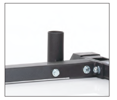
CG-8822 Olympic Bar Storage