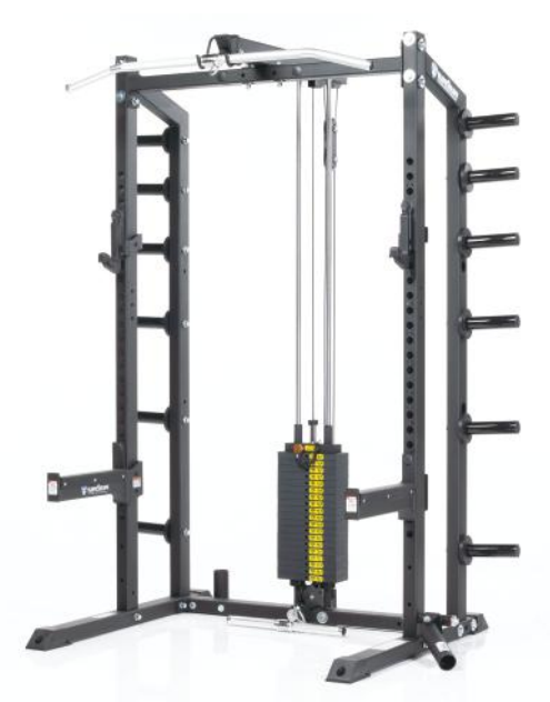
CG-8827 Hi/Low Pulley Attachment 200 lbs.weight stack (for Half Rack & Power Rack)