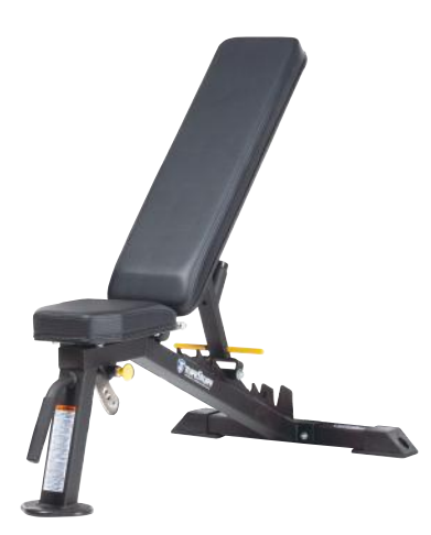
CG-8828 Flat/Incline Bench