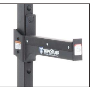
CG-8831 Safety Bar Stoppers