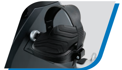
Pedal with Ratcheting Strap

The CR900ENT Semi-Recumbent Bike features the innovative entertainment console so your users can watch, browse, and listen to any media they choose. Beyond the comfort molded seat and easy access, this bike is built to perform with durable components. Commercial crank assembly and extra-large roller bearings provide smooth pedal motion that can handle even the most rigorous workout. The robust drive train system is not only durable, but designed to stand the test of time.