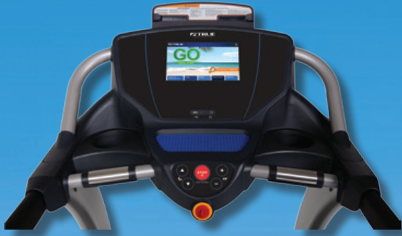
Transcend 9 Touch Screen Console