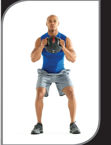
Start: Stand with feet shoulder-width apart. Hold one handle in each hand with arms bent and ball close to body just below chest height. Keep hips and shoulders square with knees slightly bent.