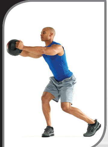
Finish: Slowly straighten arms directly in front of chest to one side of body while pivoting opposite leg and hips in the same side direction. Keep wrists firm and abdominal muscles tight, with head, shoulders and hips aligned. Hold 1-2 seconds, slowly return to start position and repeat in opposite direction.