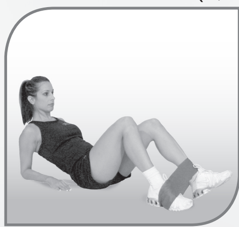
Start: Place the Flat Band Loop under foot of non-exercising leg and around ankle of exercising leg. Sit, bend legs, lean back and support upper body on elbows. Position forearms on floor with abdominal muscles tight and shoulder blades pulled together.