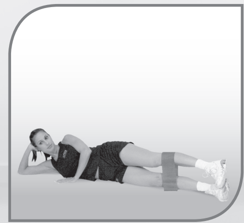
Start: Place the Flat Band Loop around lower legs. Lie on your side with top leg slightly bent and bottom leg straight, hips rolled forward, and toes pointed straight ahead. Bend bottom arm and support head with hand. Position opposite hand on the floor in front of hips.