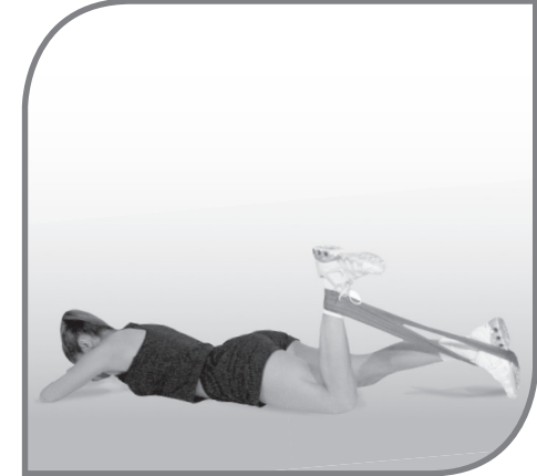
Finish: Bend exercising leg and pull heel toward buttock, while keeping the upper leg stationary and the toes of non-exercising leg firmly positioned on the floor. Hold 1–2 seconds and slowly return to start position.