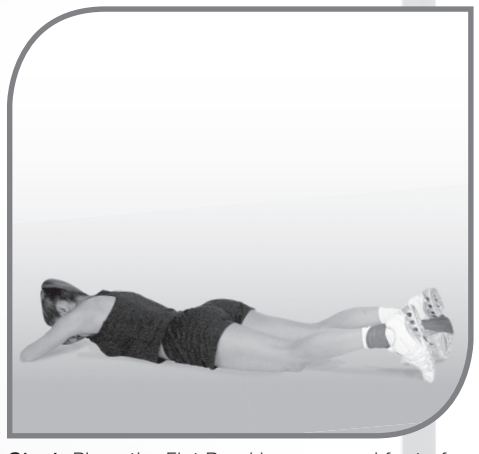
Start: Place the Flat Band Loop around foot of non-exercising leg and around ankle of exercising leg. Lie on your stomach with legs straight and feet hip-width apart. Fold arms, rest forehead on backs of hands, and press hips into floor.