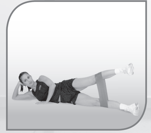
Finish: Lift top leg while keeping the non-exercising leg firmly positioned on the floor. Hold 1–2 seconds and slowly return to start position.