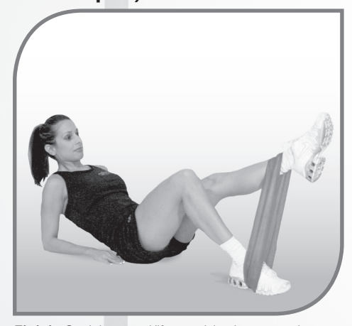
Finish: Straighten and lift exercising leg upward, point toes toward body, while keeping the foot of the non-exercising leg firmly positioned on the floor. Hold 1–2 seconds and slowly return to start position.