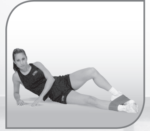
Start: Place the Flat Band Loop around foot of non-exercising leg and around lower leg of exercising leg. Lie on side with non-exercising leg on top, bend and position just behind exercising leg. Keep foot of non-exercising leg flat on floor, and straighten exercising leg. Support upper body on forearm of bottom arm. Bend and position top arm along side of body with hand on floor in front of hips.