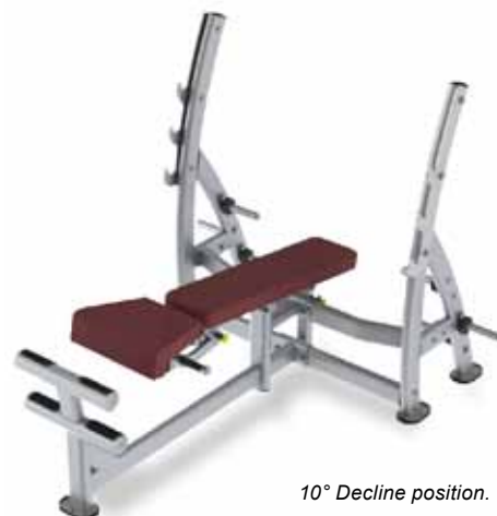
10° Decline position.