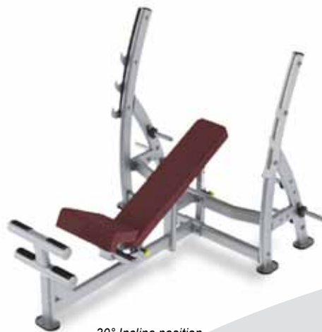
30° Incline position.