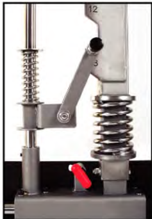
Safety Spotter, Dampening Spring and Locking Pin