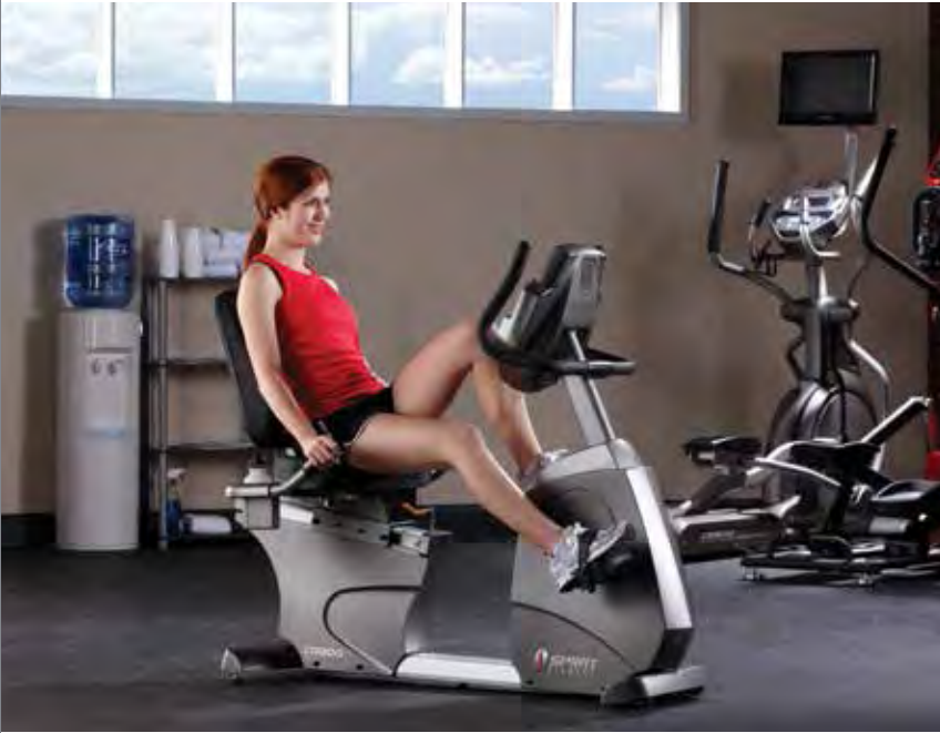
CR800 Semi-Recumbent Fitness Bike