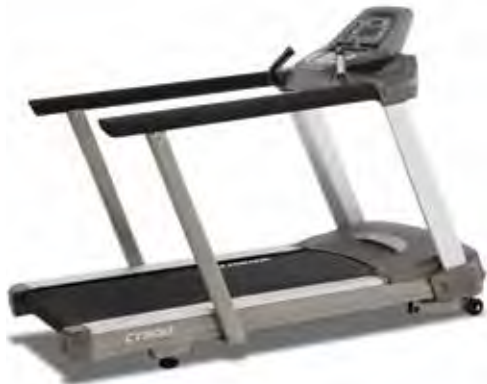
CT800 shown with optional Medical Handrails

Using the CT800 is as easy as pressing Start. Your clients are now on their way to achieving their goals. The console features motivational programming from Heart Rate to a Fit Test program using the Gerkin Protocol. Your clients will have all the critical feedback including speed, time, incline, distance, heart rate and a bar graph showing the current percentage of projected max heart rate. There is also plenty of space for a water bottle, cell phone and MP3 player and a reading rack for magazines or tablets. The ergonomically positioned heart rate hand grips make it easy for your clients to quickly check their heart rate. There is even a fan to keep your clients comfortable during their workout.