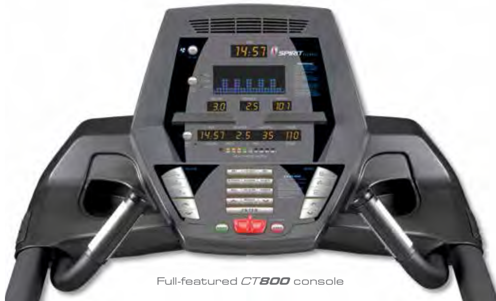
Full-featured CT800 console