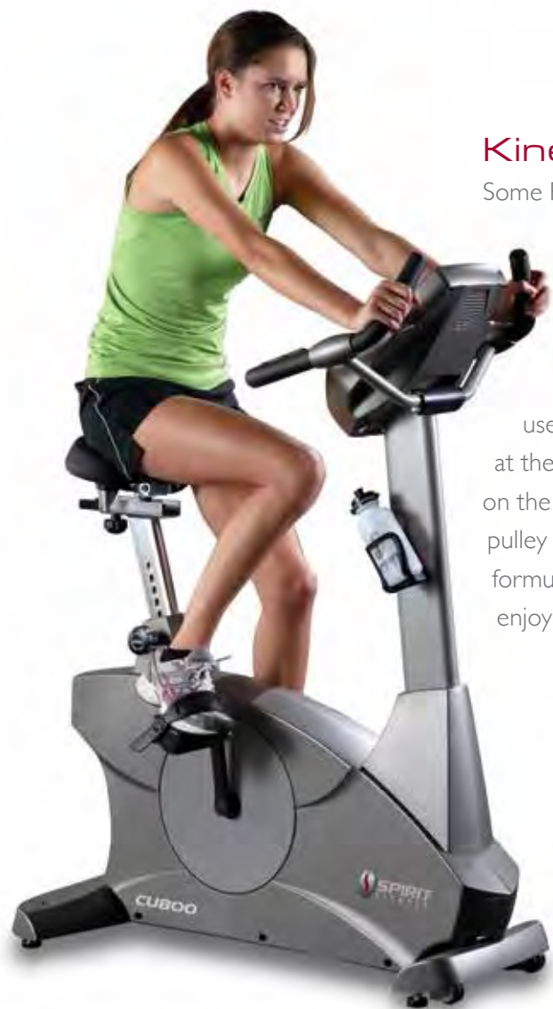
CU800 Upright Fitness Bike