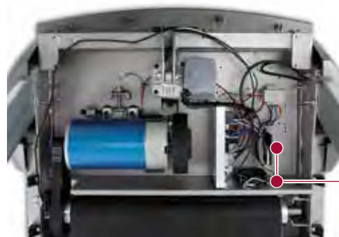
CT800 Motor Compartment