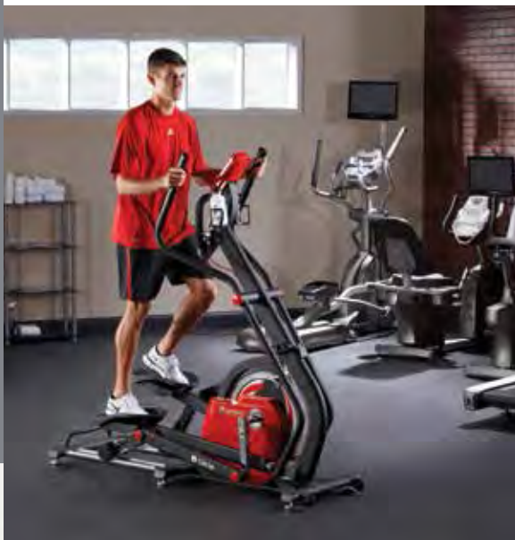
CG800 e·Glide Trainer