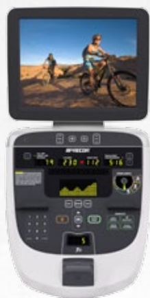
P30 Console with optional 15" Personal Viewing System